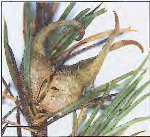
Figure 5. Dodonaea scurra (PERTH 06476201) fruit capsule showing the characteristic three, long, curved appendages for which this species is named. Scale = 3 mm.

Affinities. This species has a distinctive habit with long, spreading columnar branches. It is morphologically similar to Dodonaea caespitosa Diels, both species having linear to very narrowly obovate leaves that cluster at nodes, 6 stamens and up-curved horn-like appendages on the capsule. Dodonaea scurra is distinguished by having 4–8(13) leaves clustered at each node, distinctly rounded capsules with scattered simple white hairs (0.3–0.4 mm long) and appendages 2.1–6 mm long. Dodonaea caespitosa has only 3 or 4 leaves clustered at each node and a 3(4)-angled and glabrous capsule with appendages 1–3 mm long.